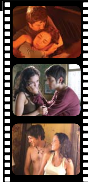
Scenes from Solo Dios Sabe